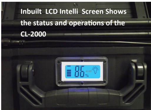
Inbuilt LCD Intelli Screen Shows the status and operations of the CL-2000

This device is weatherproof when the socket access door is closed for full charging